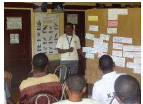
Team training in Mundemba